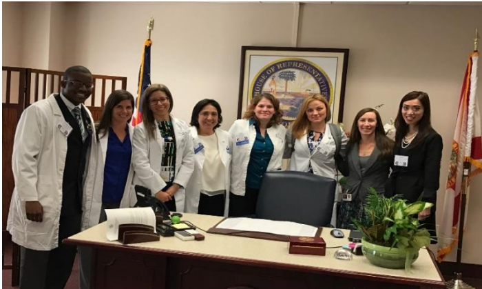
Students at the 2017 FNA Advocacy Day

To our peers, many of the laws we have in place for our profession, like the Nurse Licensure Compact (NLC) and the Barbara Lumpkin Prescribing Act, would not exist without advocacy and the joint involvement of nurses and nursing students. That is why it is important we advocate for our patients and our profession at the same time. Together we can ensure that nurses remain protected by the law and can perform to the fullest extent of their scope or practice.